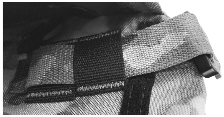
4. SEAT TUCK TAB IN FULLY. PULL UPWARDS TO CONFIRM WEBBING STRAP IS TUCKED AND SECURELY IN PLACE.