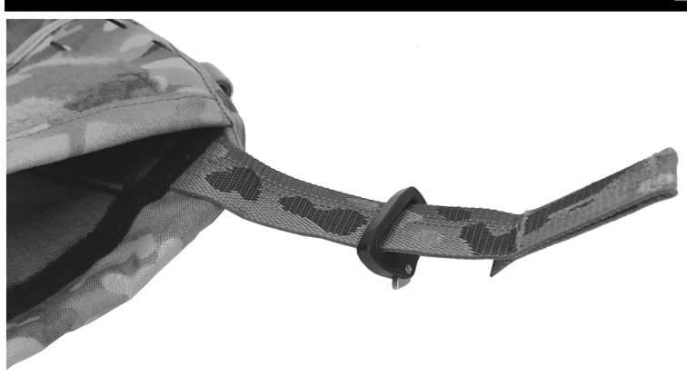
1. INSTALL FEMALE BUCKLE END ON FRONT PLATE BAG WEBBING STRAP. CHOOSE PREFFERED SIDE.

FAILURE TO INSTALL SHOULDER STRAP HARDWARE CORRECTLY COULD RESULT IN CARRIER MALFUNCTION AND/ OR IMPROPER FIT. PLEASE FOLLOW INSTRUCTIONS CAREFULLY.