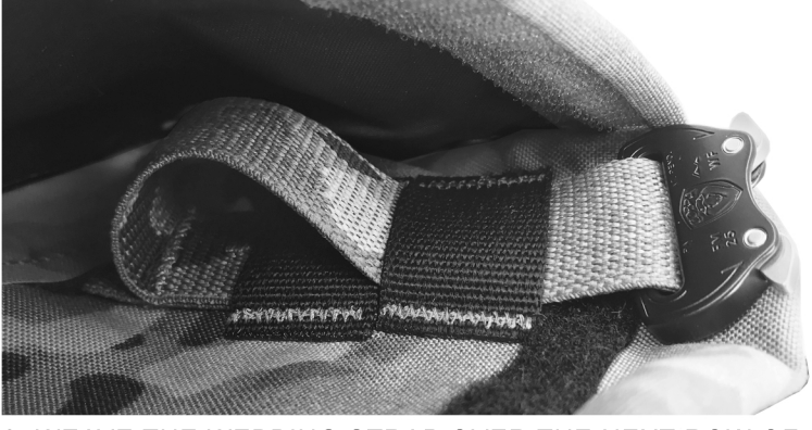
3. WEAVE THE WEBBING STRAP OVER THE NEXT ROW OF MOLLE. THEN TUCK THE RIGID TUCK TAB UNDER.