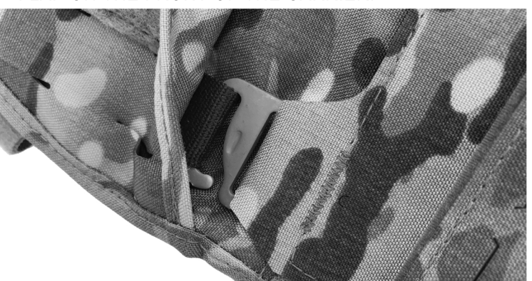
3. REPEAT FOR THE OPPOSING SIDE. ENSURE BOTH SIDES ARE FULLY HOOKED INTO THE LOOPS.