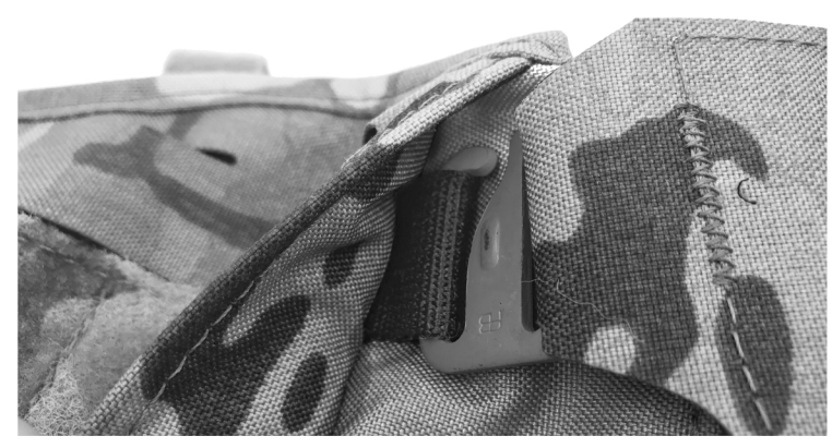
2. INSTALL THE G-HOOK OF THE FRONT FLAP FULLY INTO THE LOOP.