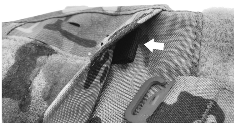
1. FIND THE HIDDEN LOOPS LOCATED UNDER THE FLAP ON THE FRONT OF THE CARRIER.

MAY FIT FLAPS/ POUCHES WITH G-HOOKS FROM OTHER COMPANIES. FERRO CONCEPTS DOES NOT GUARANTEE FITMENT OF NON FERRO CONCEPTS PRODUCTS. THE FCPC V5 WILL NOT WORK WITH OLDER VELCRO TOP FRONT FLAPS.