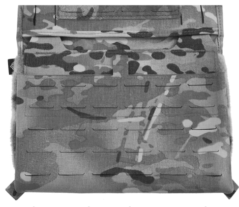
4. PULL DOWN GENTLY ON FRONT FLAP TO REMOVE ANY SLACK ON G-HOOKS AND ADHERE FLAP TO CARRIER.

INSTALLATION OF QASM BUCKLES FOR BUCKLE TOP FERRO CONCEPTS FRONT FLAPS