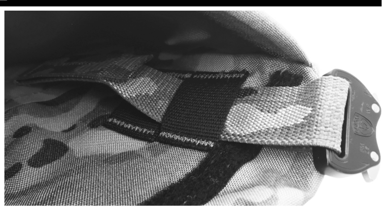
2. WEAVE THE WEBBING STRAP UNDER THE FIRST MOLLE ROW LOCATED INSIDE THE ADMIN PANEL OF CARRIER.