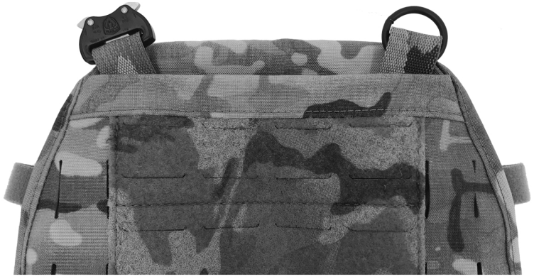
5. REPEAT STEPS 1-4 FOR OPPOSING SIDE USING RING. FRONT PLATE BAG HARDWARE IS NOW INSTALLED.