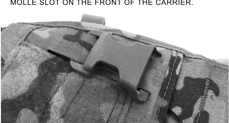
3. WHEN INSTALLED CORRECTLY, BUCKLE BARS SHOULD BE FULLY SEATED IN THE VERTICAL MOLLE SLOTS.