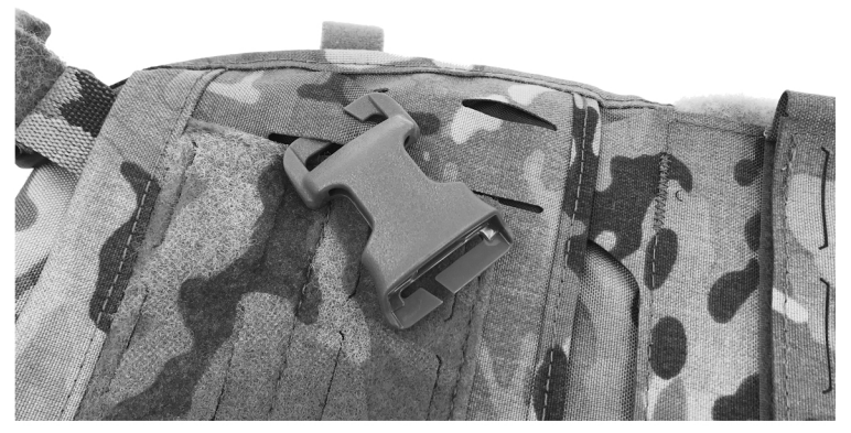
1. INSTALL TOP BUCKLE BAR INTO UPPER VERTICAL MOLLE SLOT ON THE FRONT OF THE CARRIER.

QASM BUCKLES INSTALLED ON FERRO CONCEPTS PLATE CARRIERS MAY BE COMPATIBLE WITH FLAPS/ POUCHES FROM OTHER COMPANIES. FERRO CONCEPTS DOES NOT GUARANTEE FITMENT OF NON FERRO CONCEPTS PRODUCTS.