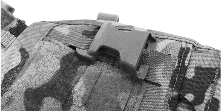
2. INSTALL BOTTOM BUCKLE BAR INTO LOWER VERTICAL MOLLE SLOT ON THE FRONT OF THE CARRIER.